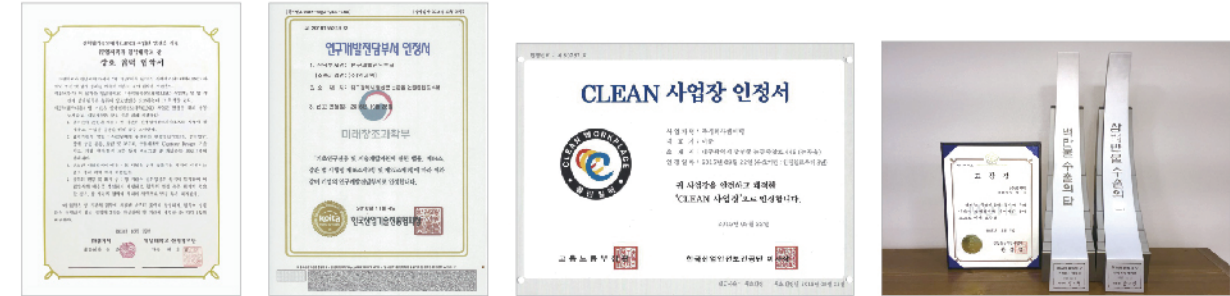
Agreement of Industrial Academic Cooperation Research and Development Division Certificate of Clean Workplace Award of Export Merit