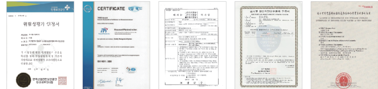
Certificate of Dangerousness Evaluation Certificate of Component Analysis Permit For Handling Hazardous Material Certificate of Origin Exporter Certificate of AQSIIQ China Metal Scrap