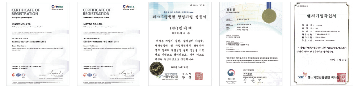
ISO 9001 ISO 14001 First Penguin Business Selection Company Patent card Certificate of Venture Company